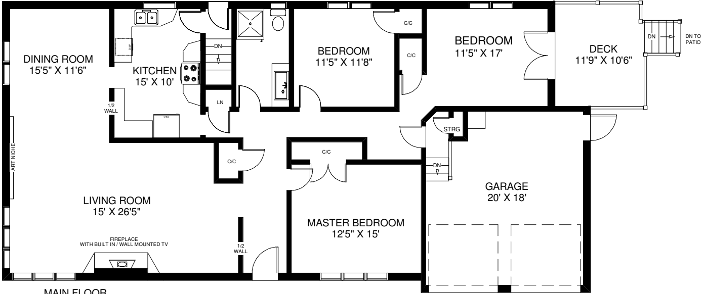
MAIN FLOOR APPROXIMATELY 1,750 SQ FT